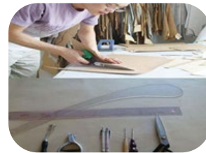
Traditional Manual Work