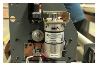
Servo Motor Drive