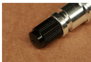
Tungsten Steel Cutter