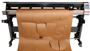
Automatic, Efficient and Precise

Clothing, Shoes & Caps, Bags & Luggage, Home Textile and other industries.