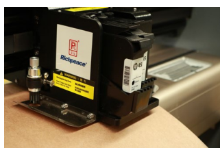
Inkjet Cutting Head